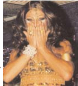
AML Rossita by Nikki, Alter Ego Studios www.nikkis-transworld.co.uk

However the restaurant has not attracted the level of interest that can maintain the running cost... So after this date the restaurant will still be available - but only for a pre booked party of minimum 10 people. (see advert for details page 15) www.wayout-publishing.com/restaurant.htm .