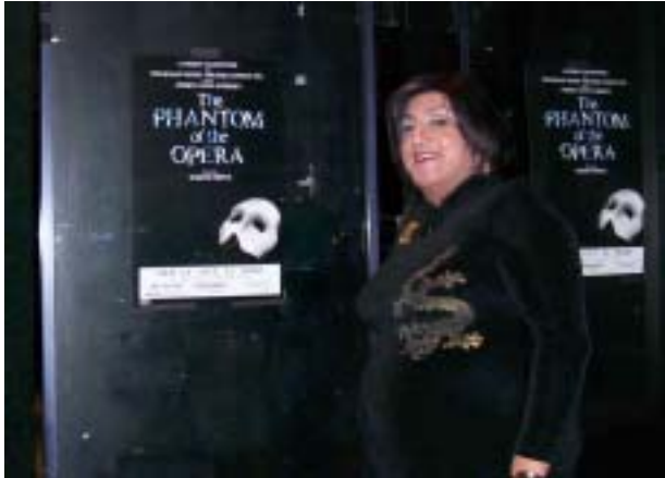
Me posing with the Phantom poster.