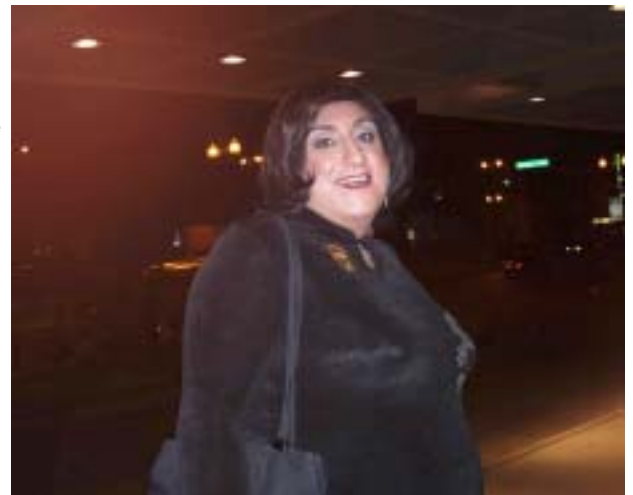
Me backing in the glow of the theatre!

Act two brought along my favourite song in the show. "Masquerade" was the title of the song and I felt proud that Masquerade girls helped me with the confidence and ability