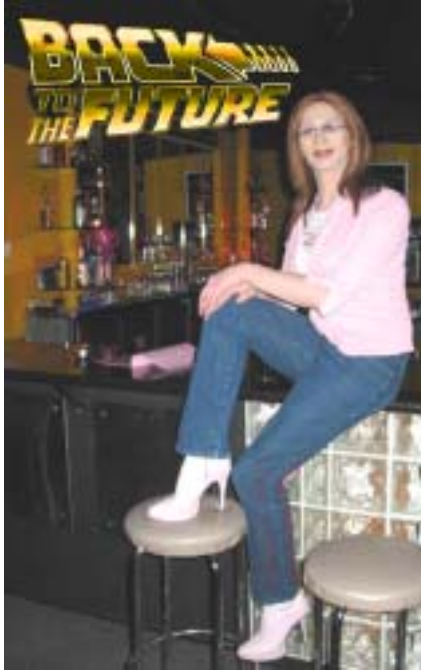
No going back for me!